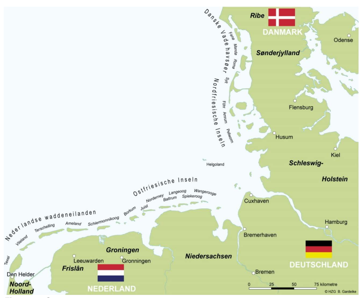
Figure 2.1 Survey area

The survey was announced in the Wadden regions of Ribe, Sønderjylland, Schleswig-Holstein, Hamburg, Niedersachsen, Groningen, Frislân and Noord-Holland including all the islands (see Figure 2.1).